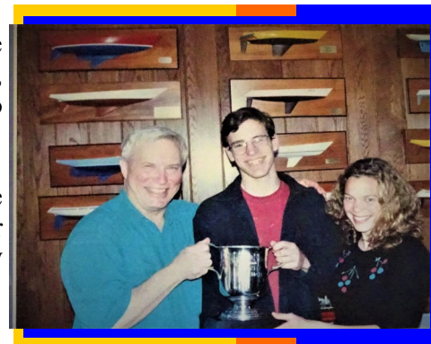
No. 1 in Frostbite Regatta