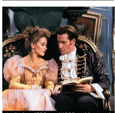
In the late 1700s and 1800s, widespread panic arose over book-reading, deemed "an outrage on decency and common sense," with concerns that avid novel-readers were becoming 'addicted' and anti-social

To accommodate members who are practicing gluten-free eating there will be a separate table for gluten free baked goods to prevent cross contamination.